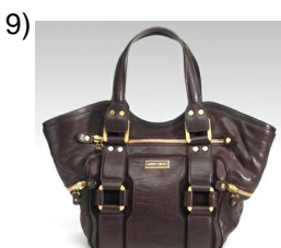
the bag, purse