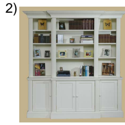
bookcase or shelves