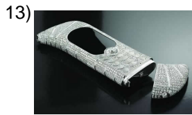
regardless of expense