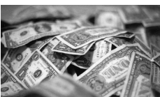
the cash, the money