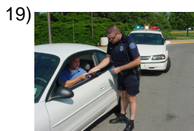
fine, penalty, traffic ticket