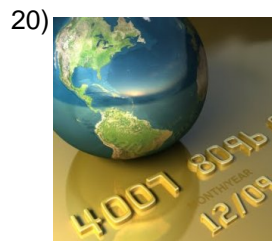
electronic funds transfer