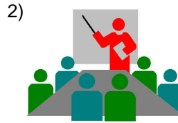
meeting, get together