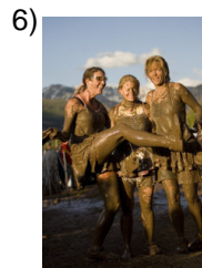
to get dirty, mess up