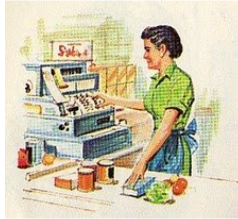
teller or cashier