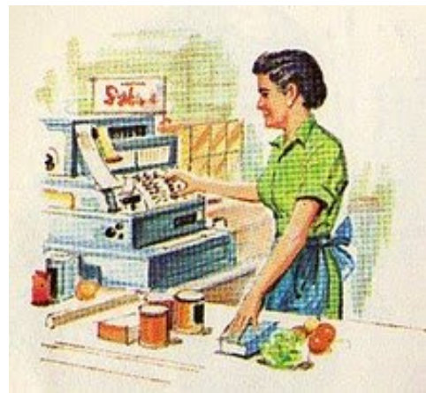
teller or cashier