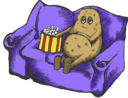
lazy, lazy person