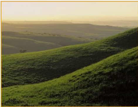
large hill, foot hills