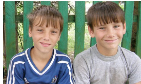
brothers or siblings