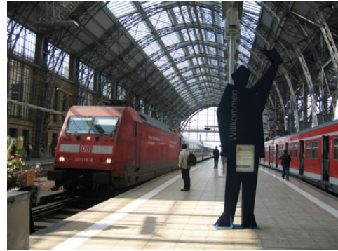
bus or train station