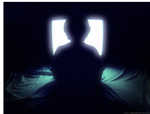
watch, to look