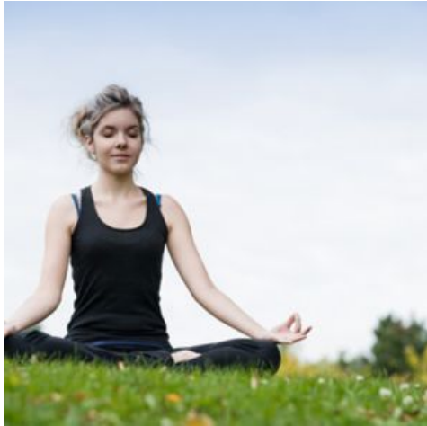
I feel very good