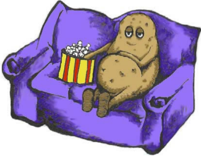
lazy, lazy person