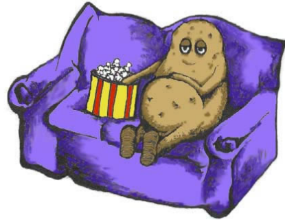
lazy, lazy person