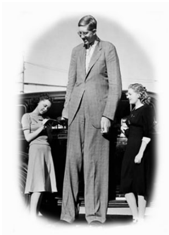
tall (masculine singular)